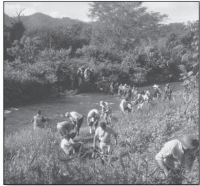
On the way to the Rio Platanó Biosphere Reserve.

2:05 P.M. This rain forest is not what I expected. For one thing, we're fairly high up, so it's warm but not hot. There are pine trees here alongside their subtropical cousins, and no triple canopy in sight. I leave my backpack on an old army cot in one of the large green canvas tents and head to the lunch tent. We're